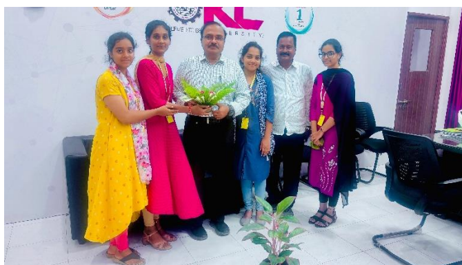
Students involved in Western/English flower arrangements